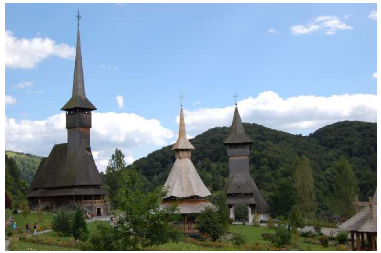
Bârsana - Church of the Presentation of the Virgin at the Temple (1720)

Wooden temples of great historical and aesthetic values are probably the best known and most typical manifestation of the Carpathian cultural heritage, probably the most valuable contribution of the region to the treasury of world art.