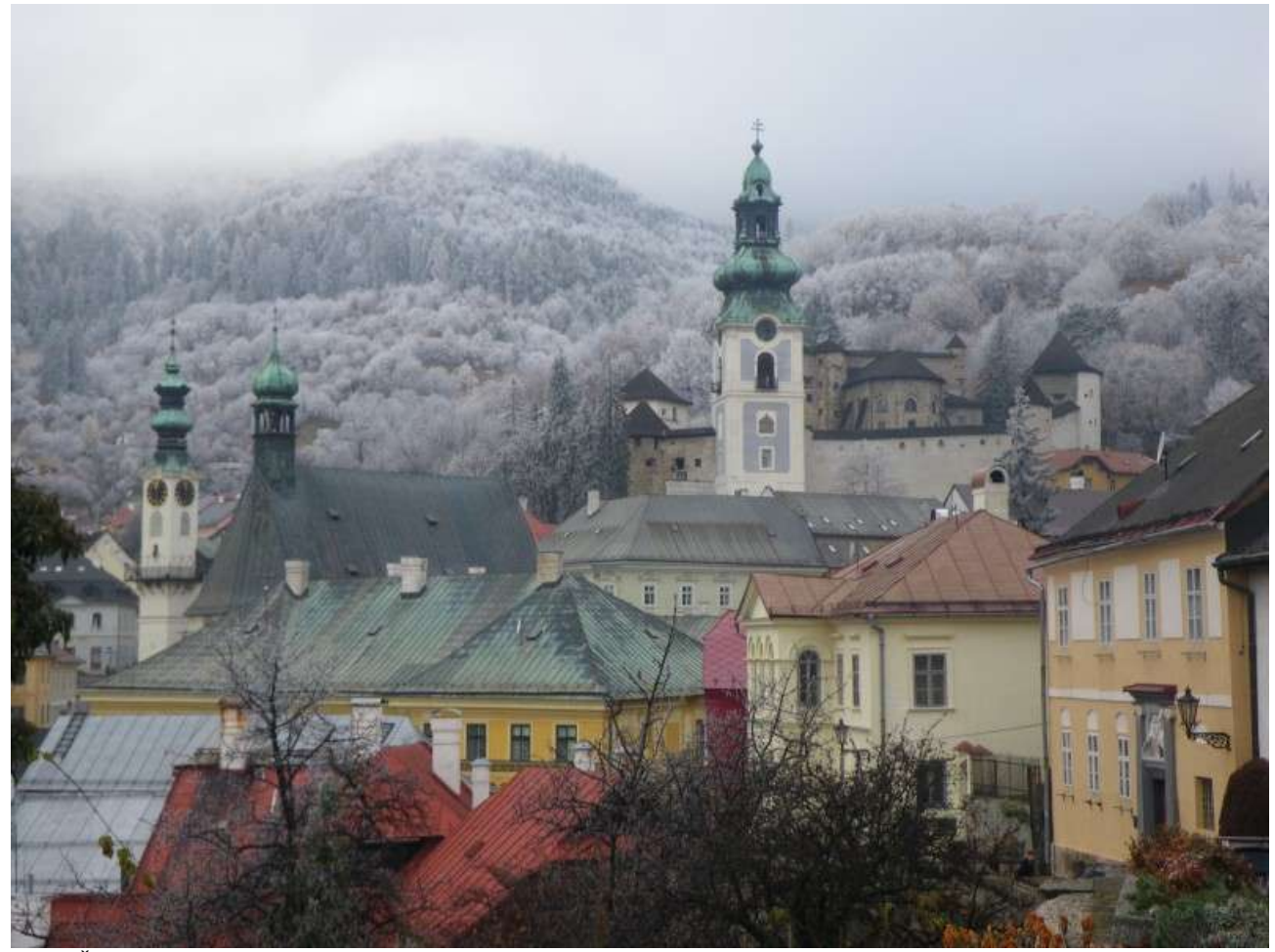
Banská Štiavnica in autumn