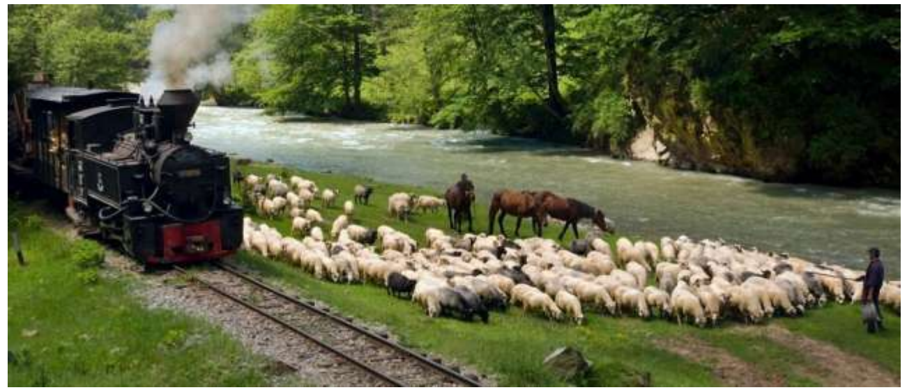
Vișeu de Sus narrow gauge railway, the last of the Carpathian forestry railways in Romania

Some of the treasures of the Carpathian cultural heritage are already used for developing the tourist industry (in a quite sustainable manner) along thematic tourist trails and routes . Many thematic trails in the Carpathian region are building on the tangible cultural heritage, by highlighting traditional wooden architecture, icons, the oil industry, traditional crafts, regional cuisine and local products , each offering its own touristic appeal.