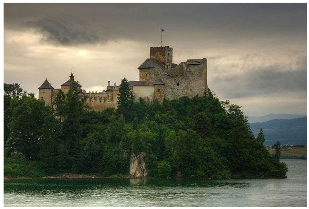
Niedzica Castle in Poland, on the Gothic Route