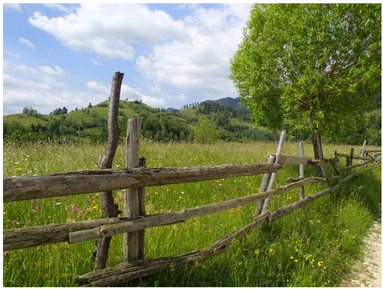
Rural landscape of Transylvania

An important element of the tangible cultural heritage of the Carpathians, determining their tourist attractiveness, are the cultural landscapes . Some of them include well-preserved historical urban and rural architectural arrangements, other are the result of traditional agricultural land-use and land management patterns, e.g. mountain pastoralism practices, common throughout the region in past centuries.